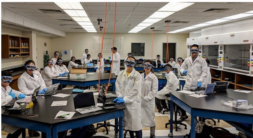
Photo: students in a newly renovated lab.

Last year, over 3,400 students enrolled in a general chemistry lab. This is approximately one third of each incoming freshman class, and with the current focus on STEM education, future growth is highly expected. The labs were in need of renovation as they had not been significantly renovated since 1968, when they were originally constructed.