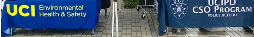
Photo: EH&S and UCPD staff at the Safety 2 U event.

On January 14, 15, and 17, Environmental Health & Safety (EH&S) hosted a three-day safety event in partnership with Transportation & Distribution Services (T&DS) and the Police Department. The event took place in the engineering quad, providing the campus research community with convenient access to DFA programs. Highlights include: