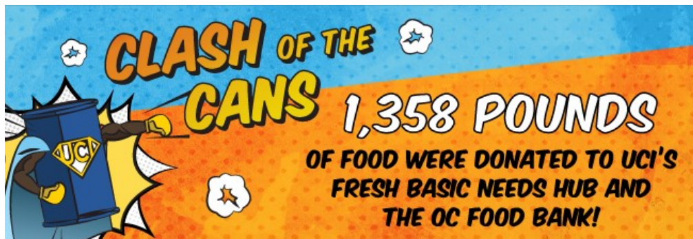
Photo: Results of 2018 Clash of the Cans.

Through a campuswide effort, we donated 1,358 pounds of food to the UCI FRESH Basic Needs Hub and OC Food Bank. UCI Transportation and Distribution Services will continue its community outreach efforts with the annual book drive , running now through March 29.