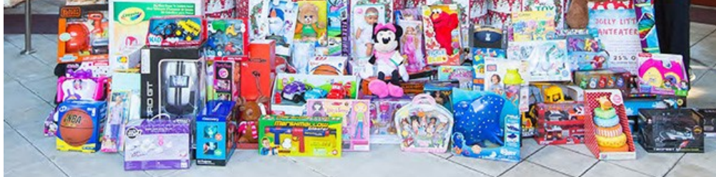
Photo: UCIPD staff with toys donated in the 2018 Toy Drive.

Keeping with tradition, the toys were gifted to children at the UCI Medical Center, specially delivered by our Police Officers, CSOs, UCI athletes, and Peter the Anteater. The team made their way around to children's bedsides to surprise them with a toy and a special greeting from Peter. Hospital staff expressed tremendous gratitude because they see the struggles that parents endure—gifting toys is a small gesture to show parents how much they appreciate being trusted to care for their children. Given the many donations received, a majority of the toys were left behind with the hospital staff so they could continue to gift toys to hospital patients throughout the month of December. The remainder of the toys were donated to Crime Survivors, Beckman Laser Institute, and the Ronald McDonald House.